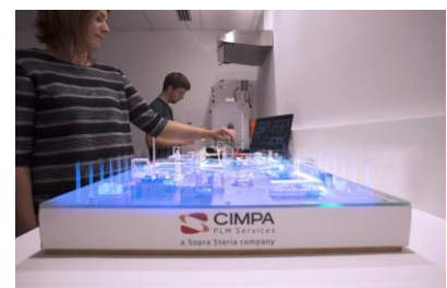
CIMPA Lab Make It Room