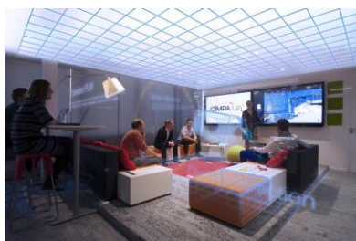
CIMPA Lab Showroom